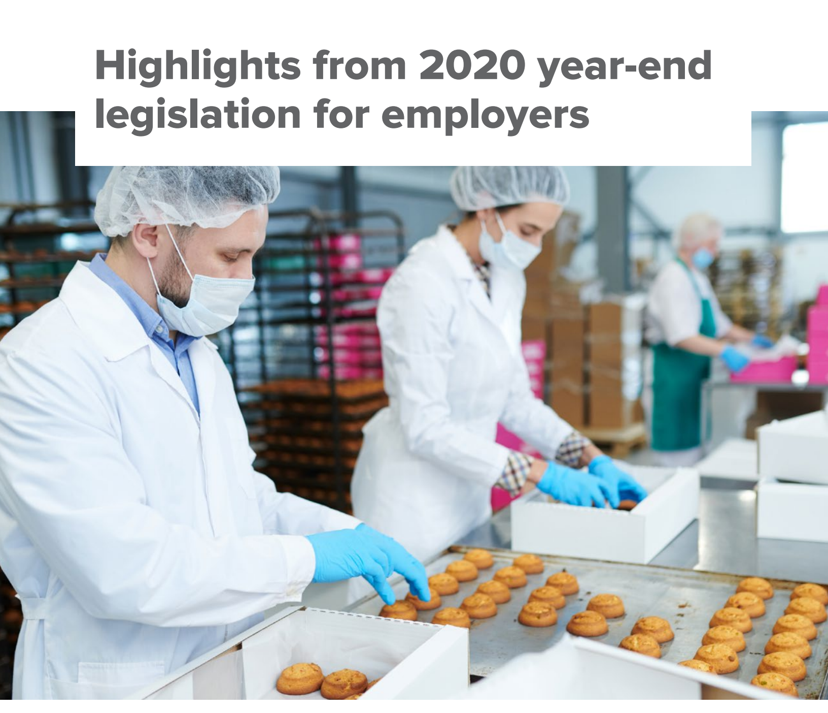
Alston & Bird LLP and Aflac